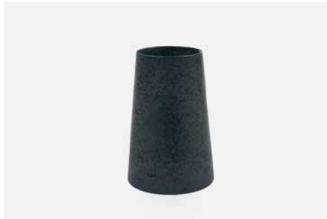
ARON CONE VASE — GREEN Material: Ceramic Size: Ø: 14 cm H: 22 cm Item no. 107100