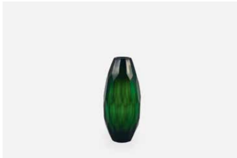
DRAKE 20 GLASS VASE — GREEN Material: Mouth blown / hand cut glass Size: Ø: 11 H: 20 cm Item no. 307106