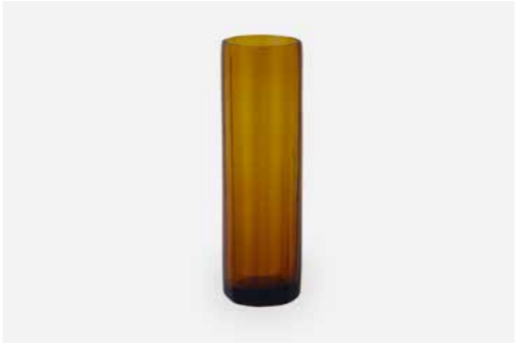
MARNI 22 GLASS VASE — AMBER Material: Mouth blown / hand cut glass Size: Ø: 6 cm H: 22 cm Item no. 308003