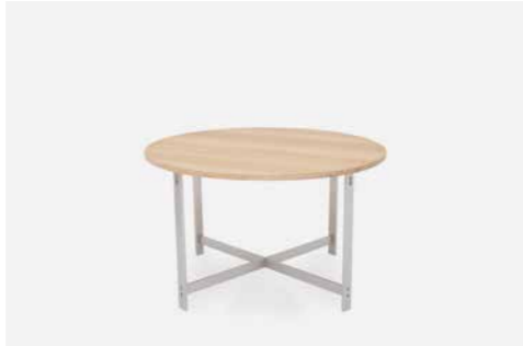
JH DINING TABLE Designer: Jørgen Høj 1962 Material: Solid wood or marble & brushed steel Size: H: 68 cm W: 115 cm Variations: Brushed steel with oak, walnut or marble