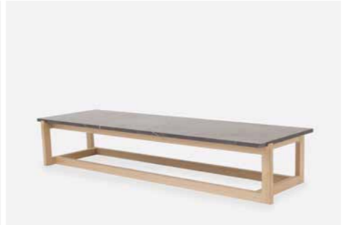
COFFEE TABLE / BENCH Material: Solid oak and marble Size: H: 30 cm W: 170 cm D: 50 cm Variations: Soaped oak & grey marble, black stained & black marble, smoked oak & grey mable