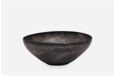
BAO — ROUND BOWL Material: Porcelain Size: Ø: 42 H: 16 cm Black / dark brown Item no. 125604