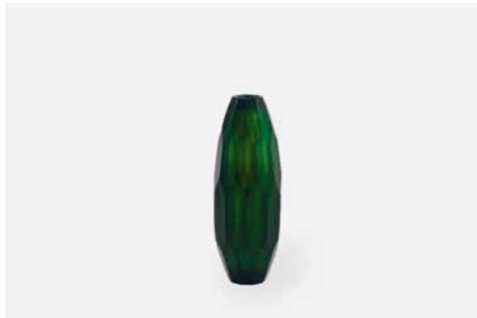
DRAKE 27 GLASS VASE — GREEN Material: Mouth blown / hand cut glass Size: Ø: 9,5 cm H: 27 cm Item no. 307107