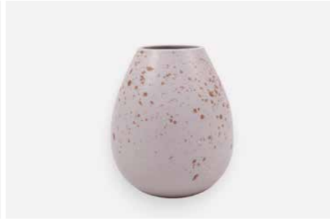
MILO DROP VASE — WHITE Material: Ceramic Size: Ø: 18 cm H: 20,5 cm Item no. 104001