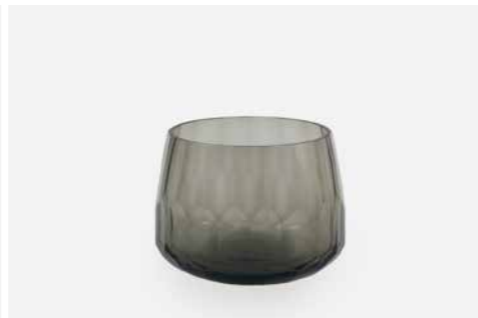
DRAKE GLASS BOWL — GREY Material: Mouth blown / hand cut glass Size: Ø: 14 cm H: 11 cm Item no. 305109