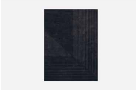
NILO RUG — ASH/CHARCOAL Designer: Lasse Storm Jørgensen Material: Handloom-woven 100% wool, Small : L: 170 cm W: 240 cm Item no. 405101 Large : L: 200 cm W: 300 cm Item no. 405102