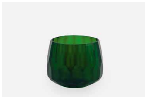
DRAKE GLASS BOWL — GREEN Material: Mouth blown / hand cut glass Size: Ø: 14 cm H: 11 cm Item no. 307109