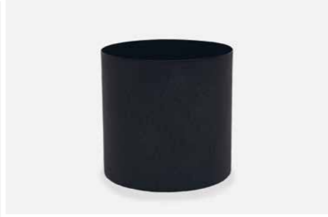
ENZO 28 FLOWER POT — GREY Material: Iron Size: Ø: 28 cm H: 18 cm Item no. 205103