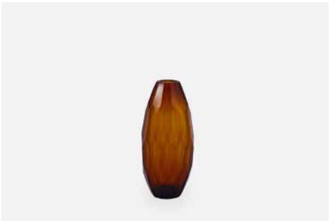
DRAKE 20 GLASS VASE — AMBER Material: Mouth blown / hand cut glass Size: Ø: 11 H: 20 cm Item no. 308006