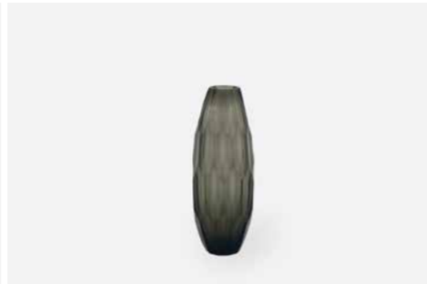
DRAKE 27 GLASS VASE — GREY Material: Mouth blown / hand cut glass Size: Ø: 9,5 cm H: 27 cm Item no. 305107