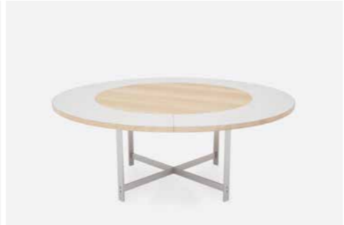
JH DINING TABLE LEAVES Material: Laminat or wood Size: 4 leaves W: 30 cm Total diameter with leaves 175 cm