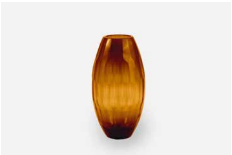
DRAKE 38 GLASS VASE — AMBER Material: Mouth blown / hand cut glass Size: Ø: 20 cm H: 38 cm Item no. 308008