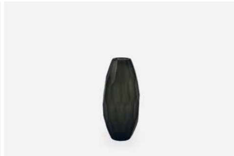
DRAKE 20 GLASS VASE — GREY Material: Mouth blown / hand cut glass Size: Ø: 11 H: 20 cm Item no. 305106