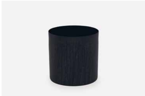
ENZO 18 FLOWER POT — GREY Material: Iron Size: Ø: 18 cm H: 18 cm Item no. 105102