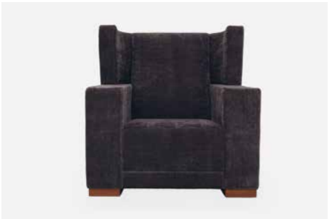
SQUARE CHAIR Material: Solid beech frame, foam, fabric upholstery Size: H: 95 cm W: 90 cm D: 90 cm Seat height: 40 cm Variations: Other fabrics and leathers available. Kvadrat, Dedar and Sørensen Leather