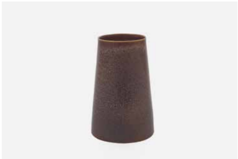
ARON CONE VASE — BROWN Material: Porcelain Size: Ø: 14 cm H: 22 cm Item no. 125501