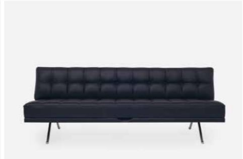
CONSTANZE DAYBED Designer: Johannes Spalt / Wittmann Material: Stainless steel/stitched cover leather Size: H: 75 cm W: 190 cm D: 74/110 cm Seat height: 44 cm Variations: Other leathers available.