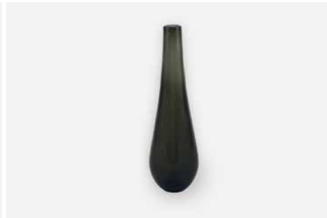
KNOX 51 GLASS VASE — GREY Material: Mouth blown glass Size: Ø: 15,5 cm H: 51 cm Item no. 305102