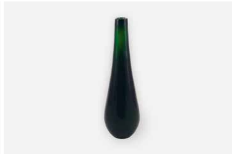
KNOX 51 GLASS VASE — GREEN Material: Mouth blown glass Size: Ø: 15,5 cm H: 51 cm Item no. 307102