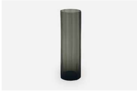
MARNI 22 GLASS VASE — GREY Material: Mouth blown / hand cut glass Size: Ø: 6 cm H: 22 cm Item no. 305103