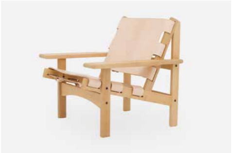
HUNTING CHAIR - Lounge chair Designer: Kurt Østervig 1960 Model: 168 Material: Solid oak and leather Size: H: 75 cm W: 78 cm D: 74 cm Seat height: 35 cm Variations: Soaped oak & natural leather, black stained & black leather, smoked oak & black leather