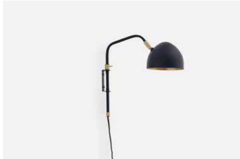
STUDIO 1 WALL LAMP Material: Brass Size: H: 40 cm Black / black Item no. 204102