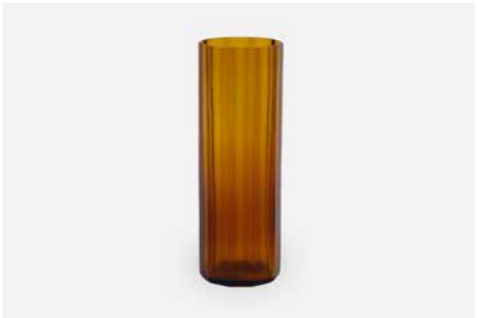
MARNI 30 GLASS VASE — AMBER Material: Mouth blown / hand cut glass Size: Ø: 10 cm H: 30 cm Item no. 308004