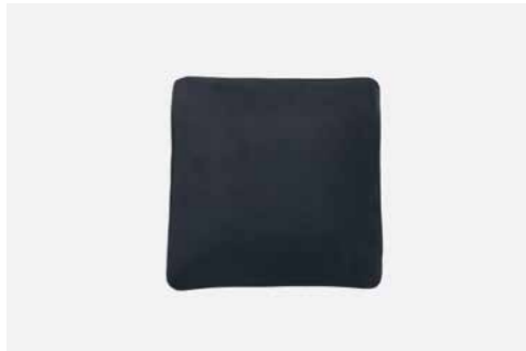
SEAT PAD — BLACK Material: leather Size : W: 45 cm D: 45 cm Other leathers available