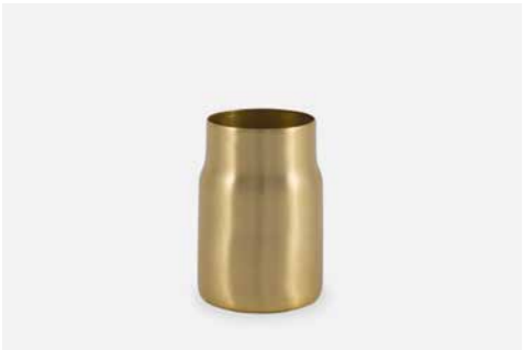
YORK 10 BRASS VASE Material: Solid brass Size: Ø: 6 cm H: 10 cm Mat brass Item no. 212002