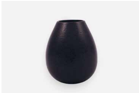
MILO DROP VASE — BLACK Material: Ceramic Size: Ø: 18 cm H: 20,5 cm Item no. 104101