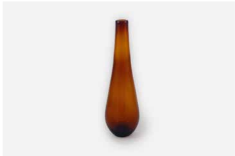
KNOX 51 GLASS VASE — AMBER Material: Mouth blown glass Size: Ø: 15,5 cm H: 51 cm Item no. 308002