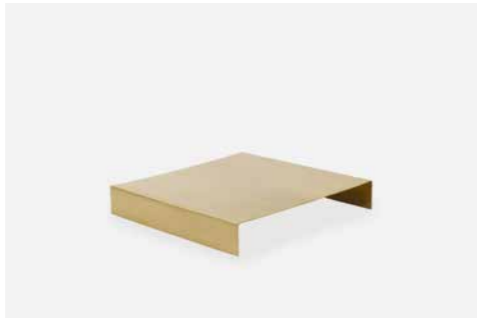
TRAY TO SQUARE CHAIR Material: Solid matt brass Size: W: 20 cm D: 20 cm Item no 212004