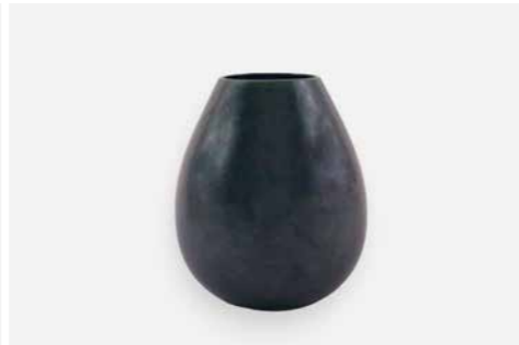
MILO DROP VASE — GREEN Material: Ceramic Size: Ø: 18 cm H: 20,5 cm Item no. 107101