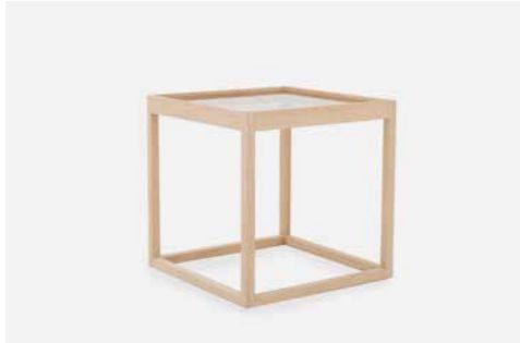
CUBE Designer: Kurt Østervig Material: Solid oak and glass Size: H: 40 cm W: 40 cm D: 40 cm Variations: Soaped oak & smoked glass, soaped oak & clear glass, black stained & smoked glass, smoked oak & smoked glass