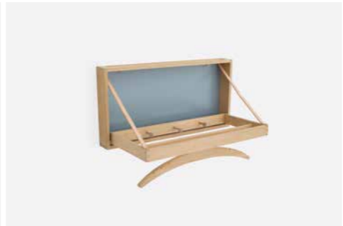
THE HANGER Designer: Adam Hoff & Poul Østergaard 1964 Material: Solid oak Size: H: 27,5 cm W: 55,5 cm D: 6,5/29 cm Variations: Soaped oak & grey blue, soaped oak & white, soaped oak & black