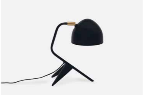
STUDIO 1 TABLE LAMP Material: Brass & cast iron Size: H: 40 cm Black / black Item no. 204101