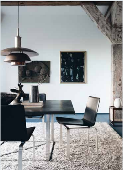
JH 3 DINING CHAIR

The seating element covered with leather floats over the metal legs, giving the The JH 3 Dining Chair an outstanding expression of lightness. This chair has a simple and aesthetic design and can easily be combined with a numerous amount of today's modern tables.