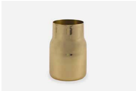
YORK 14 BRASS VASE Material: Solid brass Size: Ø: 8 cm H: 14 cm Shiny brass Item no. 212101