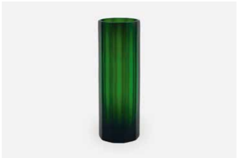
MARNI 30 GLASS VASE — GREEN Material: Mouth blown / hand cut glass Size: Ø: 10 cm H: 30 cm Item no. 307104