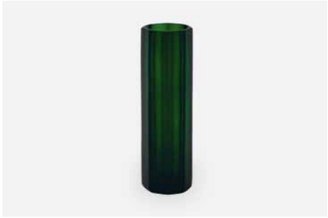
MARNI 22 GLASS VASE — GREEN Material: Mouth blown / hand cut glass Size: Ø: 6 cm H: 22 cm Item no. 307103