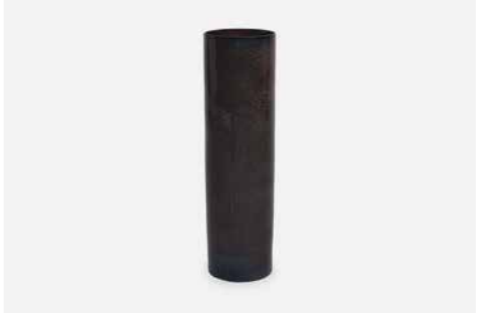
LEON 66 CYLINDER VASE Material: Porcelain Size: Ø: 18 cm H: 66 cm Black / dark brown Item no. 125602