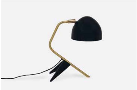
STUDIO 1 TABLE LAMP Material: Brass & cast iron Size: H: 40 cm Brass / black Item no. 202001