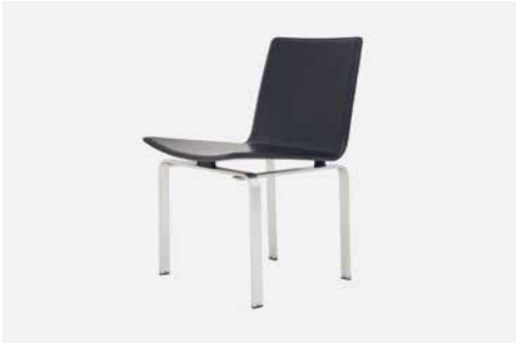
JH 3 DINING CHAIR Designer: Jørgen Høj 1962 Material: Upholstered leather & brushed steel Size: H: 75 cm W: 50 cm Seat height : 45 cm Variations: Brushed steel & saddle leather, brushed steel & black leather