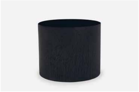
ENZO 30 FLOWER POT — GREY Material: Iron Size: Ø: 36 cm H: 30 cm Item no. 205104