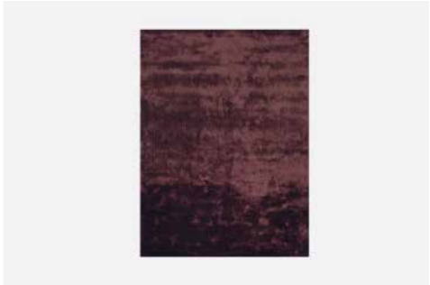
PETRI RUG — ROSE Designer: Lasse Storm Jørgensen Material: Handloom-woven 100% viscose, exclusive velvet-look expression. Small: L: 170 cm W: 240 cm Item no. 468101 Large: L: 200 cm W: 300 cm Item no. 468102