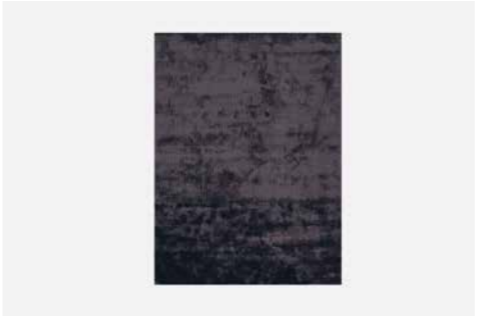
PETRI RUG — DUST GREEN Designer: Lasse Storm Jørgensen Material: Handloom-woven 100% viscose, exclusive velvet-look expression. Small: L: 170 cm W: 240 cm Item no. 467001 Large: L: 200 cm W: 300 cm Item no. 467002