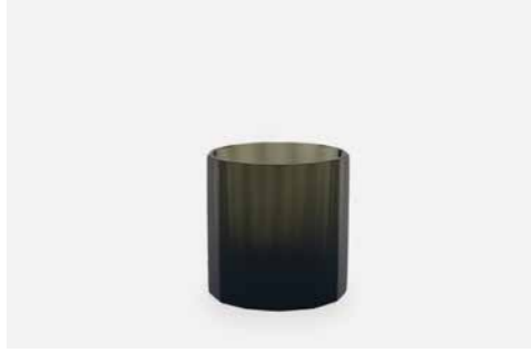
MARNI GLASS — GREY Material: Mouth blown / hand cut glass Size: Ø: 8,5 cm H: 8,5 cm Item no. 305110