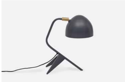
STUDIO 1 TABLE LAMP Material: Brass & cast iron Size: H: 40 cm Grey Item no. 205001