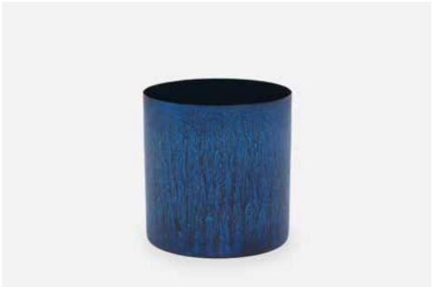
ENZO 18 FLOWER POT — BLUE Material: Iron Size: Ø: 18 cm H: 18 cm Item no. 206102