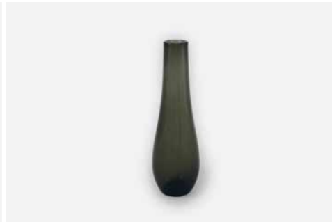
KNOX 33 GLASS VASE — GREY Material: Mouth blown glass Size: Ø: 10,5 cm H: 33 cm Item no. 305101