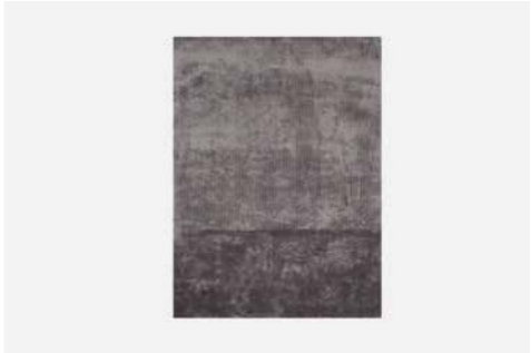
PETRI RUG — ASH Designer: Lasse Storm Jørgensen Material: Handloom-woven 100% viscose, exclusive velvet-look expression. Small: L: 170 cm W: 240 cm Item no. 465001 Large: L: 200 cm W: 300 cm Item no. 465002