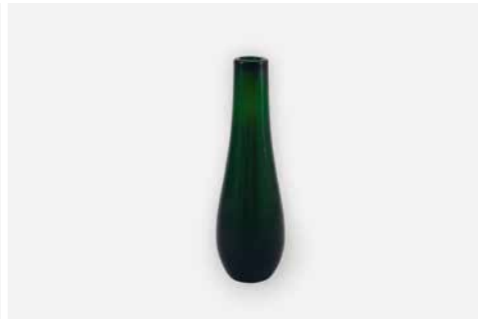
KNOX 33 GLASS VASE — GREEN Material: Mouth blown glass Size: Ø: 10,5 cm H: 33 cm Item no. 307101