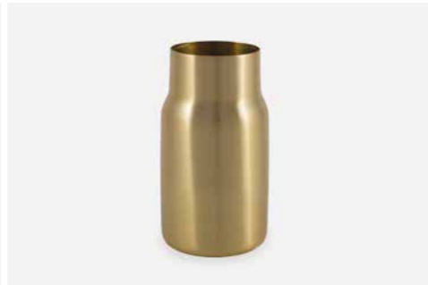
YORK 18 BRASS VASE Material: Solid brass Size: Ø: 8 cm H: 18 cm Matt brass Item no. 212003