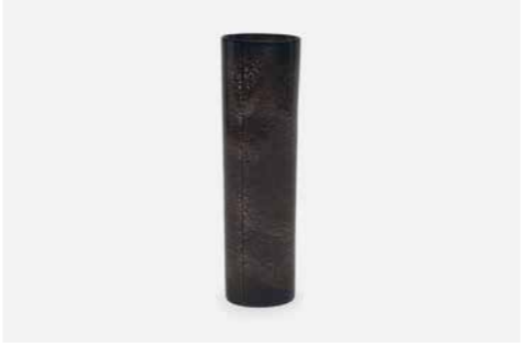
LEON 48 CYLINDER VASE Material: Porcelain Size: Ø: 14 cm H: 48 cm Black / dark brown Item no. 125603