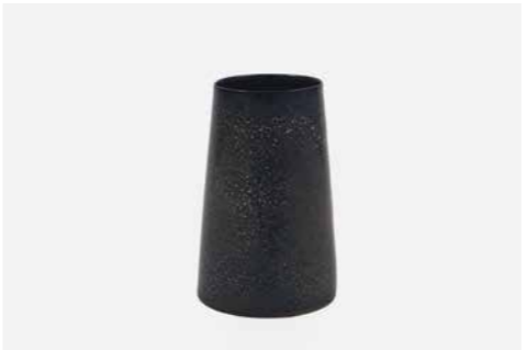
ARON CONE VASE — BLACK / DARK BROWN Material: Porcelain Size: Ø: 14 cm H: 22 cm Item no. 125601