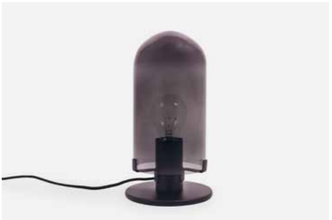
STUDIO 2 TABLE LAMP Material: Iron & glass Size: H: 26 cm Black / black Item no. 204103