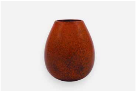
MILO DROP VASE — ORANGE Material: Ceramic Size: Ø: 18 cm H: 20,5 cm Item no. 108001