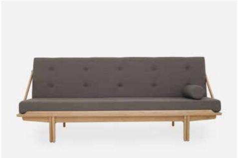
PV DAYBED Designer: Poul Volther 1958 Material: Solid oak and fabric or leather upholstery Size: H: 80 cm W: 193 cm D: 81/110 cm Seat height: 42 cm Variations: Soaped oak, black stained, smoked oak, walnut Upholstery: fabrics and leathers available from Kvadrat, Dedar and Sørensen Leather