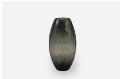
DRAKE 38 GLASS VASE — GREY Material: Mouth blown / hand cut glass Size: Ø: 20 cm H: 38 cm Item no. 305108