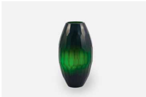
DRAKE 38 GLASS VASE — GREEN Material: Mouth blown / hand cut glass Size: Ø: 20 cm H: 38 cm Item no. 307108