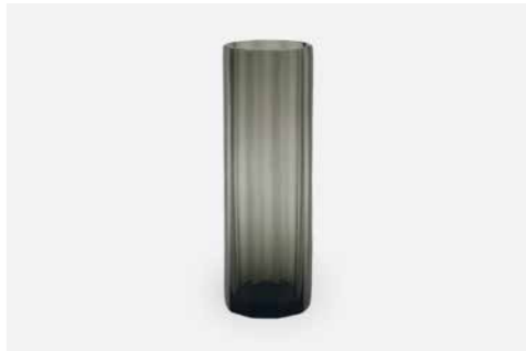
MARNI 30 GLASS VASE — GREY Material: Mouth blown / hand cut glass Size: Ø: 10 cm H: 30 cm Item no. 305104