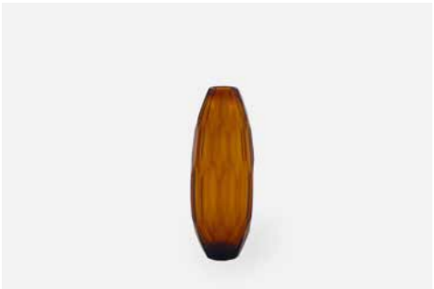
DRAKE 27 GLASS VASE — AMBER Material: Mouth blown / hand cut glass Size: Ø: 9,5 cm H: 27 cm Item no. 308007