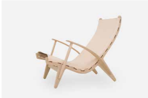
PV LOUNGE CHAIR Designer: Poul Volther 1952 Material: Solid oak and leather Size: H: 80 cm W: 68 cm D: 90 cm Seat height: 35 cm Variations: Soaped oak & natural leather, black stained & black leather, smoked oak & black leather