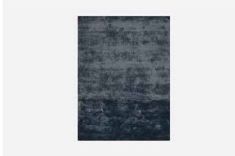
PETRI RUG — CHARCOAL Designer: Lasse Storm Jørgensen Material: Handloom-woven 100% viscose, exclusive velvet-look expression. Small: L: 170 cm W: 240 cm Item no. 465101 Large: L: 200 cm W: 300 cm Item no. 465102