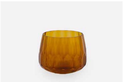
DRAKE GLASS BOWL — AMBER Material: Mouth blown / hand cut glass Size: Ø: 14 cm H: 11 cm Item no. 308009