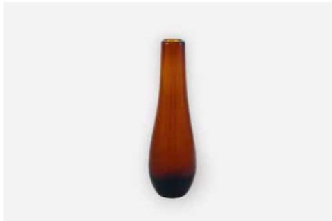
KNOX 33 GLASS VASE — AMBER Material: Mouth blown glass Size: Ø: 10,5 cm H: 33 cm Item no. 308001